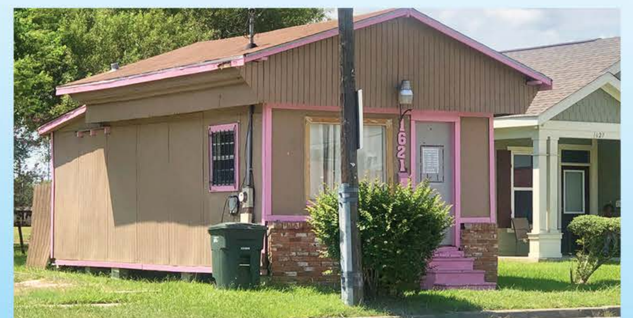
financed as part of the loan.

Equity Contribution: Borrowers are expected to contribute a minimum of 10% (certain circumstances will warrant a higher contribution). This is a significant cash flow benefit to the borrower as most commercial lenders require 20-30%. Closing costs and fees can be applied to the equity contribution. Excess costs and fees (above 10%) can be